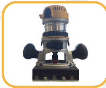
A machined attachment guide provides users with the ability to quickly cut down a long row of Anchor Studs.