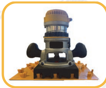
A machined attachment guide provides users with the ability to quickly cut down a long row of Anchor Studs.