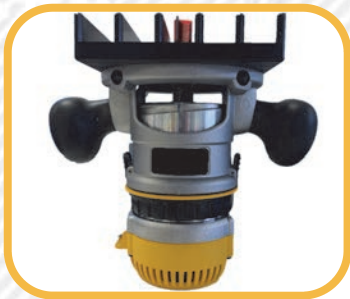
Adjustable head allows for quick and easy setup of cutting depth when removing Anchor Studs.