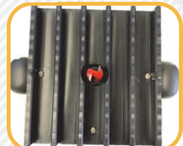
A 7/8" Router Bit allows for complete removal of all studs along a row.

Many custom models available upon request. Call for details. Specifications on reverse.